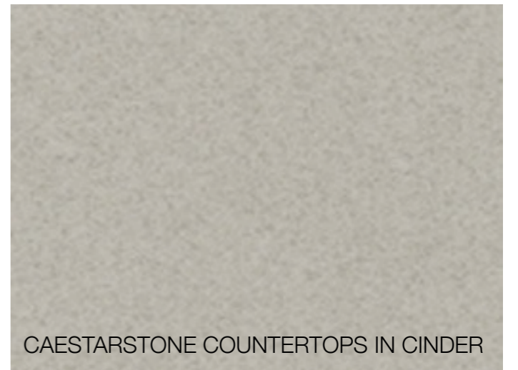
CAESTARSTONE COUNTERTOPS IN CINDER