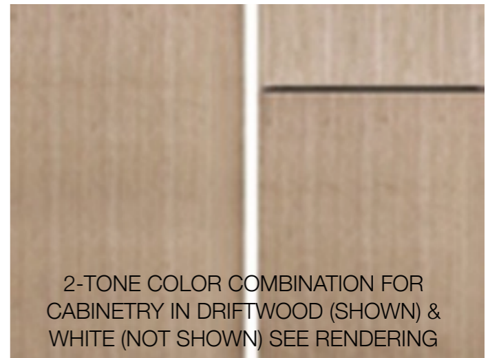
2-TONE COLOR COMBINATION FOR CABINETS IN DRIFTWOOD (SHOWN) & WHITE (NOT SHOWN) SEE RENDERING