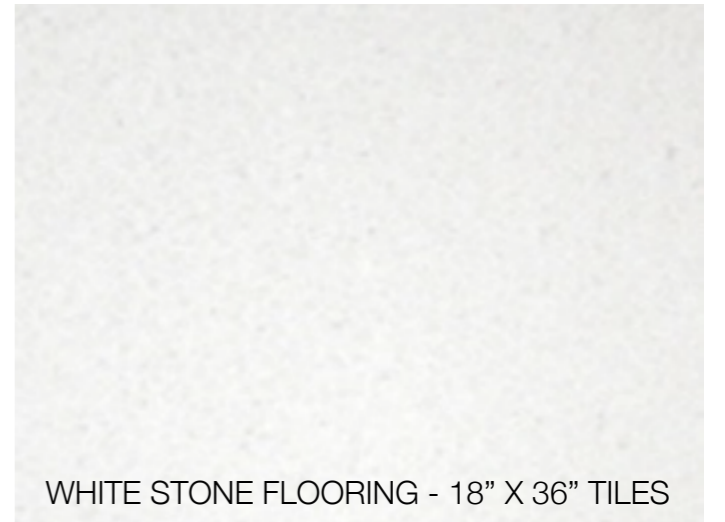
WHITE STONE FLOORING - 18" X 36" TILES