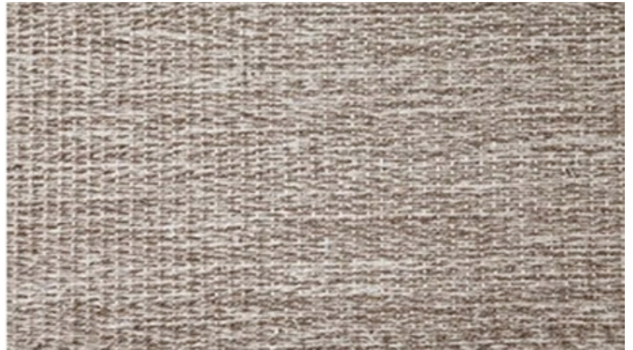
2-TONE SILK AND SISAL WOVEN RUG