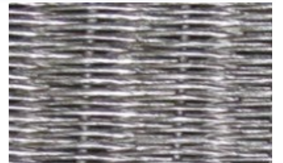
OYSTER GRAY RATTAN